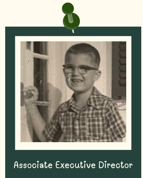
Associate Executive Director