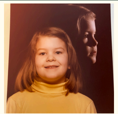
Events and Marketing Manger

A funny family memory: Let's call it the time when I was learning to drive on the back streets of Meredith and proceeded to hit the garage when trying to pull into it, and made a nice dent in it! When my Mom ran out to ask what the noise was, I feigned ignorance. All while still sitting in the driver's seat.