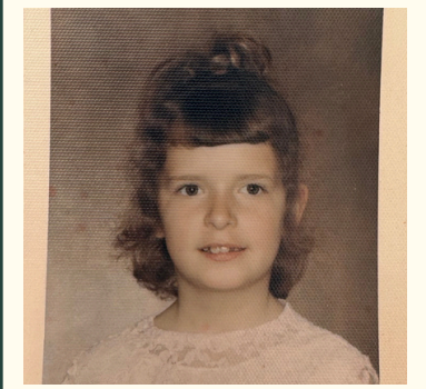
Student Services Center Director