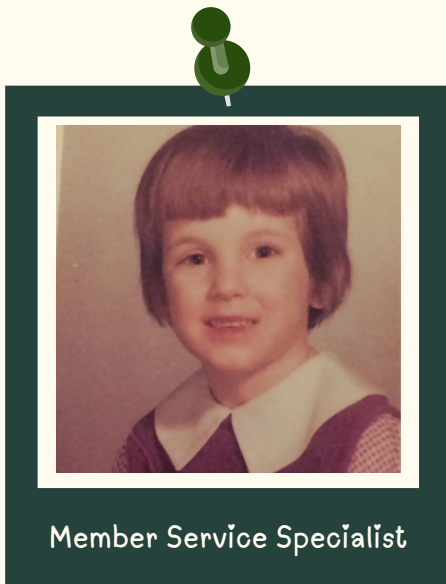
Member Service Specialist